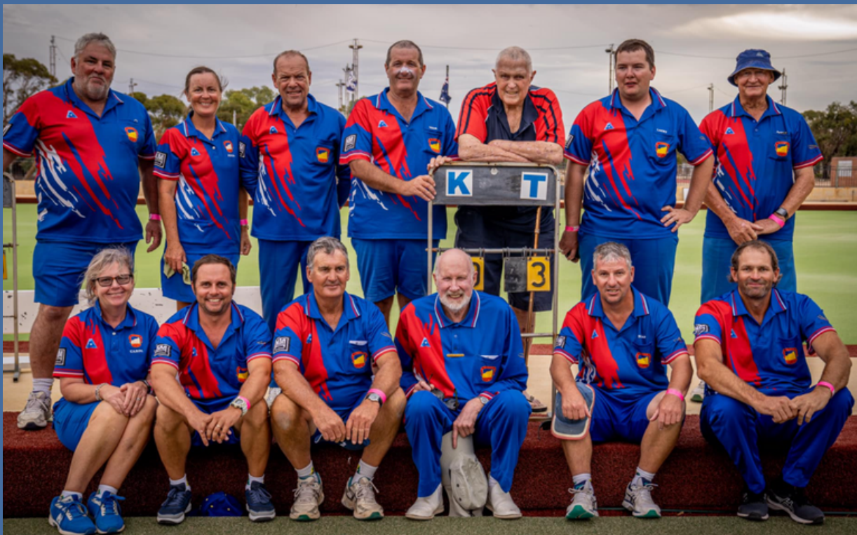
Tammin Bowling Club securing the Division 2 Grand Final win.