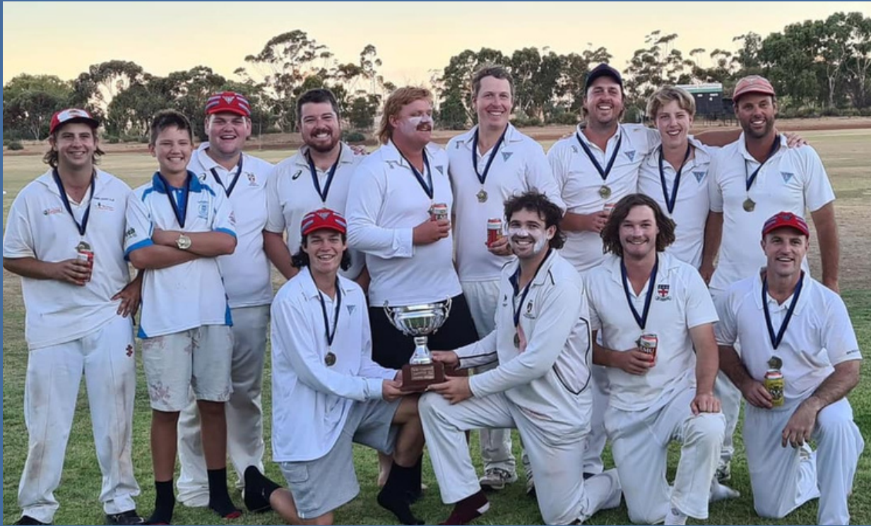
Tammin Cricket Club with the trophy after winning the Cricket Grand Final.