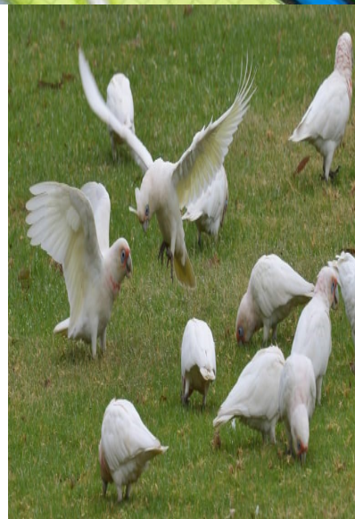
Damages caused by Corellas

Please contact the Shire Administration Office if you have any queries.