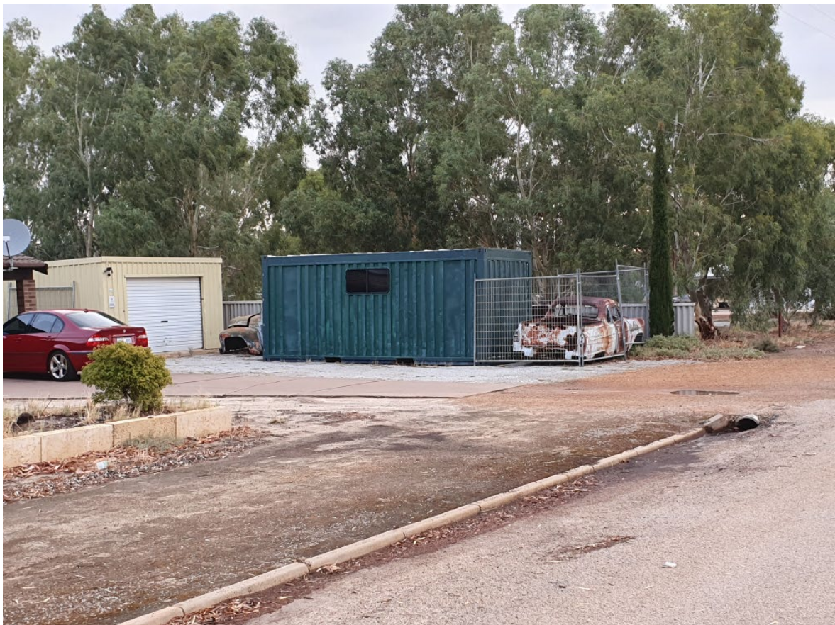
Site Photo No.2 on 30 March 2022