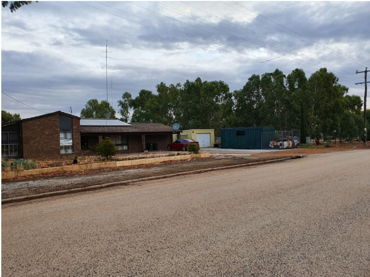
Site Photo No.1 taken by Shire's CEO on 30 March 2022