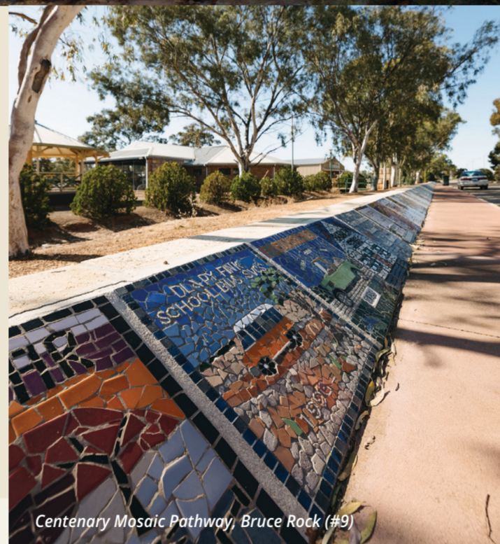
Centenary Mosaic Pathway, Bruce Rock (#9)

Travelling from Kellerberrin along the Granite Way you will reach Kokerbin Rock (see #7 at map ref C7), the third largest monolith in Australia. Drive to the top for sweeping views over the countryside, or park at the base and walk to the peak, taking in the native flora and fauna and Devil's Marbles. Nearby at Kwolyin (see #7a at map ref C7), is a free camp site with toilets, camp kitchen and picnic shelters. The Kwolyin loop trails take visitors through bushland, across Coarin Rock and a walk along the old railway line. Visitors can also take a stroll around the old town site and learn more of its history from the interpretive signage. On your drive toward the town of Bruce Rock, stop in at Shackleton to see Australia's smallest bank (see #8 at map ref C7). Once you arrive in Bruce Rock take a stroll along the Centennial Mosaic Pathway located on Johnson Street (see #9 at map ref E7), visit the Bruce Rock Museum (where you will find an original one-room school house and replica mudbrick settlers' cottage) and Machinery Museum. Then meander through the beautifully landscaped grounds of Remembrance Park, which features memorials, sculptures and artworks designed to depict the theme of war and peace.