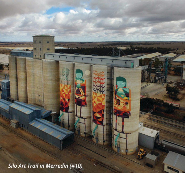
Silo Art Trail in Merredin (#10)

Club Hotel P: (08) 6424 8833, Palace Hotel P: (08) 9049 1555, Railway Tavern P: (08) 9049 1030, Sandalwood Motor Lodge P: (08) 9049 1212, Southern Cross Motel P: (08) 9049 1144, Southern Cross Caravan Park P: (08) 9049 1212, Hampton View Homestead (located 60km south west of Southern Cross) P: 08 9040 4075, Nulla Nulla Farm Retreat (located in Moorine Rock) P: 0428 498 010, "King of the Cross" (4-bedroom home) www.shorttermrentalswa.com.au , Havcon Engineering Accommodation Village P: (08) 9729 1977 Meals Club Hotel, BP Roadhouse, Shell Roadhouse, Southern Cross Coffee Lounge, Southern Cross Stationary Store, Southern Cross Motel, Palace Hotel, Railway Tavern Visitor Information Shire of Yilgarn P: (08) 9049 1001 E: tourism@yilgarn.wa.gov.au W: visit.yilgarn.wa.gov.au