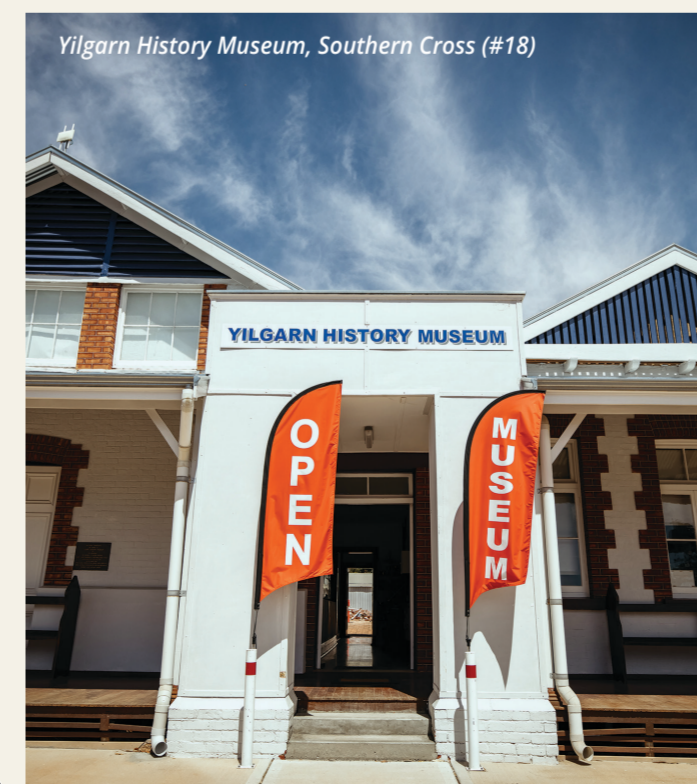
Yilgarn History Museum, Southern Cross (#18)

Southern Cross was named after the stars that guided early prospectors to their gold find. It's surrounded by some of the largest farms in Western Australia and stands at the western gateway to the world's largest and healthiest temperate woodland; the Great Western Woodlands. For your final night on the Eastern Wheatbelt self-drive trail, stay at the heritage listed Palace Hotel, the Railway Tavern or the Club Hotel, the town's first hotel built in 1888. There is also a local motel, caravan park and self-contained accommodation. Enjoy sunset with panoramic views of the town, surrounding farmland and goldmines from Wimmera Hill Lookout. Start the next day early with a drive 34km south of town to Frog Rock Nature Reserve (see #16 at map ref J5). Here you will find beautiful wildflowers in the spring with a wave-like rock formation and dam at the base of the rock. From Frog Rock you can make the journey back to Southern Cross and take in the Yilgarn History Museum (see #18 at map ref K3) open daily, for a glimpse of the rich history of the area. Or if time permits, travel east to Karalee Dam (see #17 at map ref M4), approximately 55km east of Southern Cross to see the natural reservoir that was adapted to maximise the catchment, delivery and storage of rainwater essential to railway development in the Goldfields region.