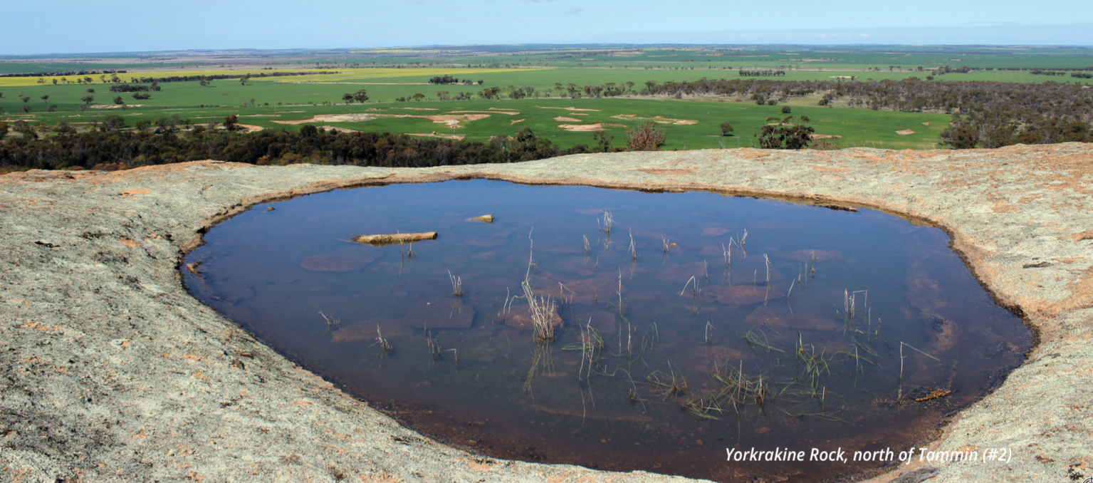
Yorkkrakine Rock, north of Tammin (#2)

Your journey along the Eastern Wheatbelt self-drive trail starts in Tammin (see #1 at map ref B5), 184km or 2 hours east of Perth along the Great Eastern Highway. In Tammin you will find the Kadjininy Kep Tammin Hydrology Model and Amphitheatre, located at the Memorial Park on the corner of Great Eastern Highway and Booth Street. The model demonstrates how salinity impacts the Wheatbelt landscape. Shaded grassed areas with BBQ facilities and a playground make this a perfect place to stop for a picnic with public toilets available at the rear of the Shire Office. From town travel 26km North to Yorkkrakine Rock, a solid granite outcrop surrounded by native flora. Follow the walk trail up and over the rock where you'll find gnamma holes, pockets of vegetation, and sweeping views of the surrounding landscape. Yorkkrakine Rock (see #2 at map ref B4), is a sacred Aboriginal Women's birthing place and also part of a beedawang (initiation journey) songline. The songline starts in Perth and travels eastward to Yorkkrakine Rock and then follows the Salt Lake systems and granite outcrops to Wave Rock. Retrace your steps back toward town and continue on 14kms south to Charles Gardner Reserve (see #3 at map ref B6). The 600 hectares of natural vegetation contains a wide variety of wildflowers and understorey, some of which are unique to the region.