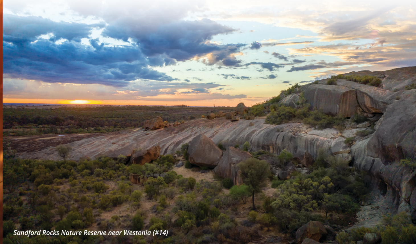
Sandford Rocks Nature Reserve near Westonia (#14)