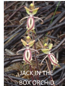
JACK IN THE BOX ORCHID